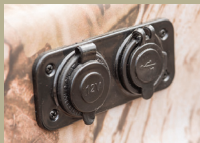
12V / USB power outlet