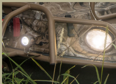
Enhanced exterior lighting package