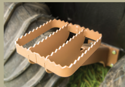
Right and left entry step