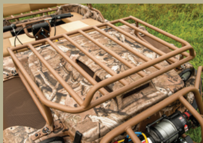
Heavy duty hood rack