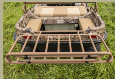
2-position, fold down, storage rack