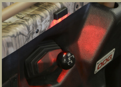
Interior lighting package